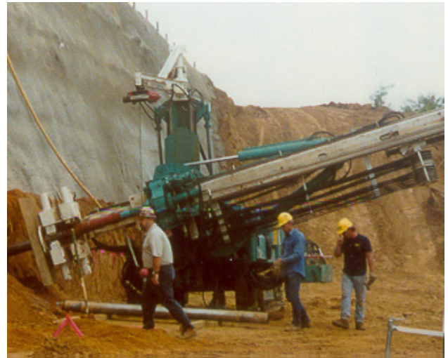
Inclined drilling for soil nail installation.

D'Appolonia has developed numerous designs to stabilize slopes for highway, railroad, industrial and commercial project sites. These projects have employed soil nails, anchors, mi-