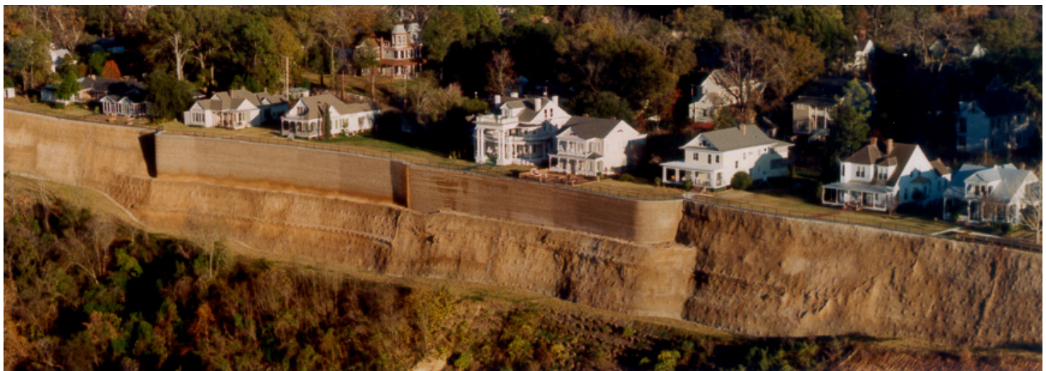
Aerial view of the loess bluff following completion of the project.

MSE walls have been constructed in several regions of the country.